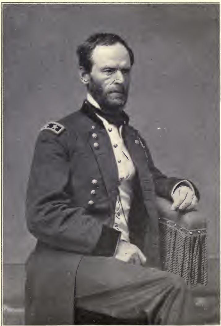
MAJOR-GENERAL W. T. SHERMAN, 1864